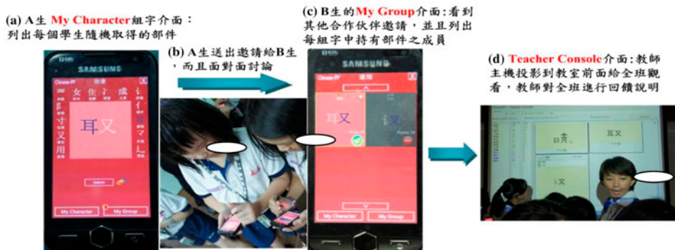
Figure 2. Mobile-assisted Chinese-PP game interface.